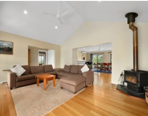
165 Camp Road Greta, NSW