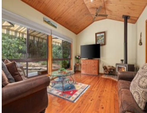
85 Wyndham Street Greta, NSW